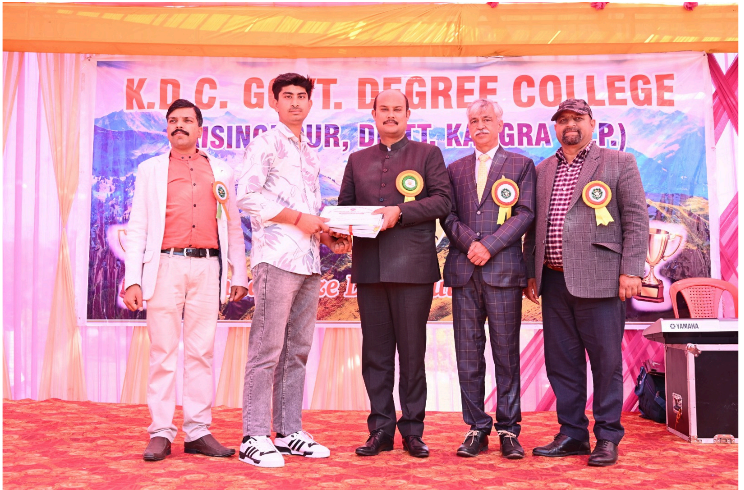
ROVER AND RANGER UNIT OF COLLEGE DURING 5 DAYS CAMP AT REWALSAR

Disclaimer: Admissions in BCA and PGDCA are subject to final affiliation of the courses with the HP University Shimla, for which we have already applied and expecting approval in the coming few days. The final number of seats in different categories will also be known at that time. For any update, please keep looking on the college website. The college reserves the right to make any changes and corrections in the content of this document if and when required without any notice.