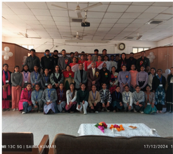
NSS students during 7 days camp